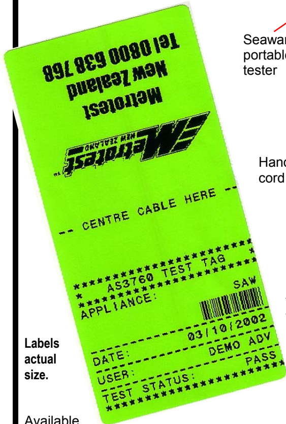
Labels actual size.

The whole system fits onto a two wheeled trolley with a toolbox fitted to the bottom for those necessary tools and accessories.